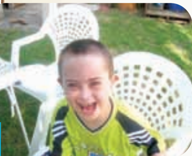
Members of the Jesus Te Ama group are learning the joy of God's love